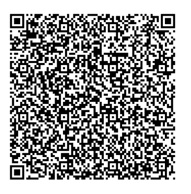
Check out farmers markets in the area. https://cvfoodfarmnetwork. org/local-food-listings/.