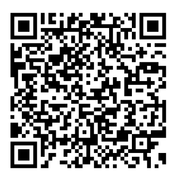
Seasonal Guide to locally grown produce It will vary each year based on the weather.